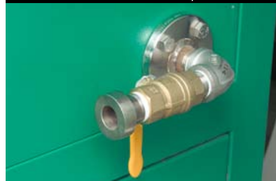
Exterior dryer system hookup