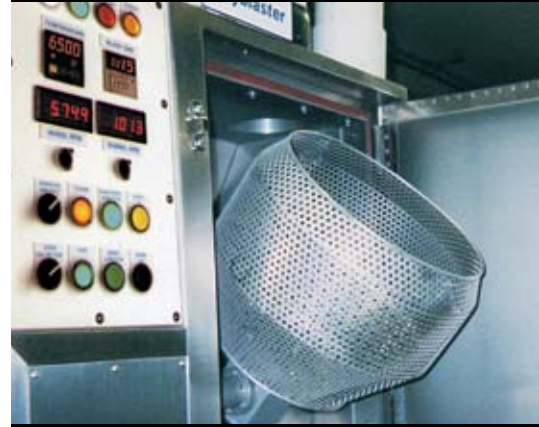
Easy loading and unloading tilt basket design