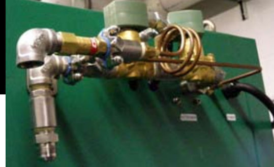
Convenient exterior hookup for air and nitrogen