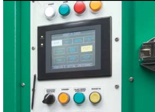
Control shown with touch screen option.